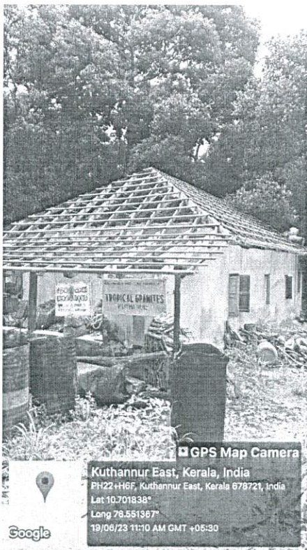
Demolishing the build structure Within 50m distance