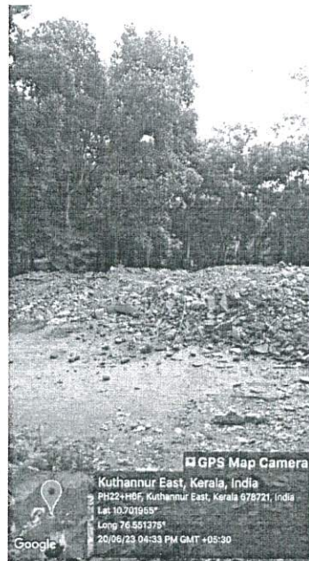
Land after the demolition of the structure