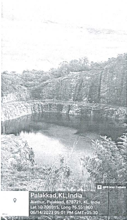
Water stored in the nearby abandoned quarry pit