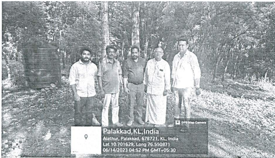
Proponent and RQP with subcommittee members during inspection