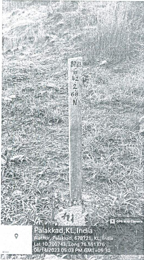
Boundary pillar No 13