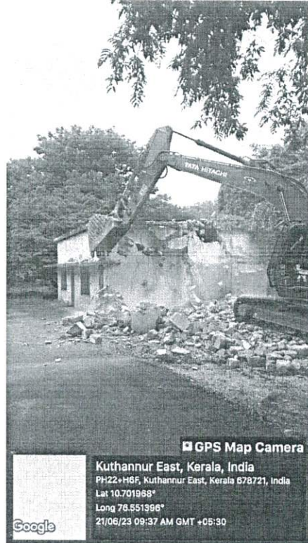
Demolishing the build structure within 50m distance